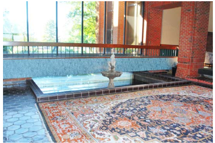
Interior of Kastle Construction Building