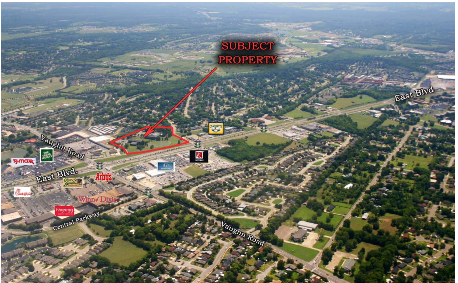
Former Kastle Construction Building